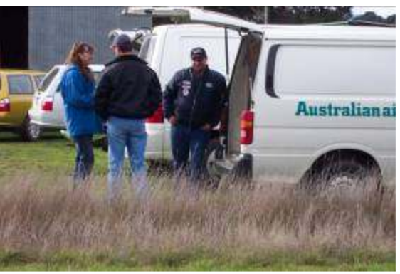
WAITING FOR RESULTS

As I have noted many times, the meeting of propellers and fingers still seems to be a favourite trick for many of us. Although it sounds a bit of lark the injuries sustained by some of our members are very severe. Some have lost fingers and others the full use of them. Please be careful around props and use effective aircraft restraints when starting. Most important of all, do not reach over a turning prop, go behind to release the glow plug and adjustments. Safety is a continuing thought process.