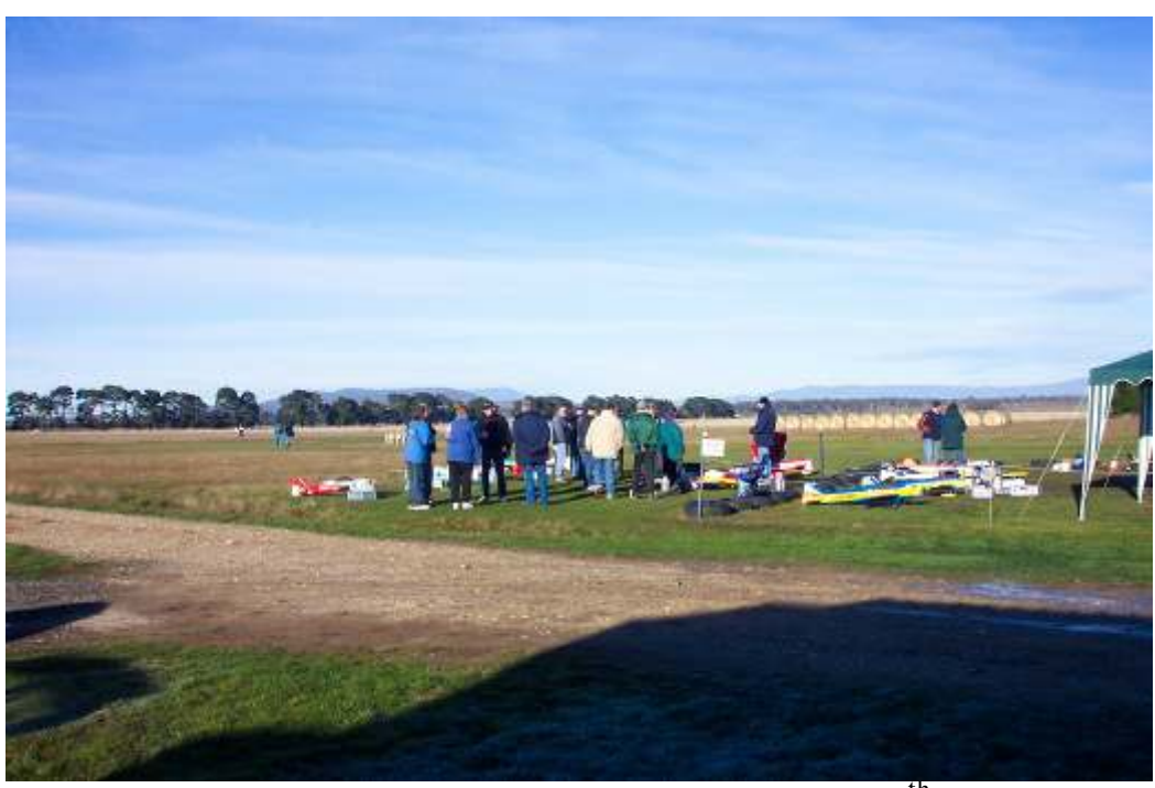
BEFORE THE EXCITEMENT BEGINS!!! 18<sup>th</sup> June, 05