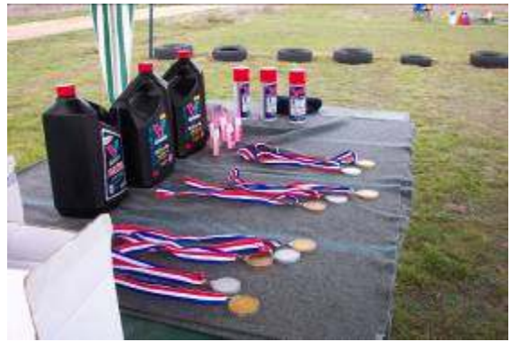
TROPHY'S ON DISPLAY