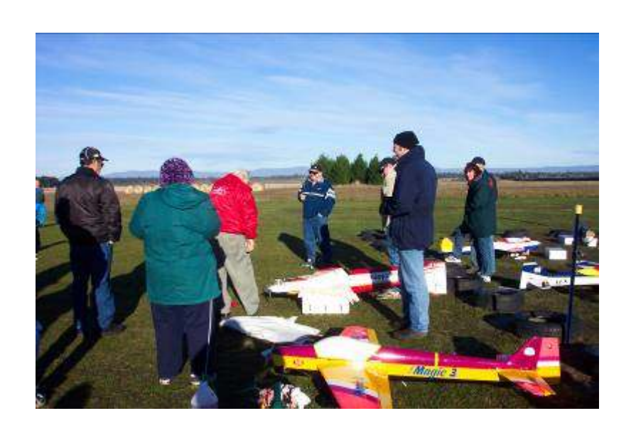
THE CALM BEFORE THE STORM

Contests to be on the day specified. If weather is not suitable, then the next day, Sunday. If that too is not suitable then the event is cancelled and we move to the next contest scheduled.