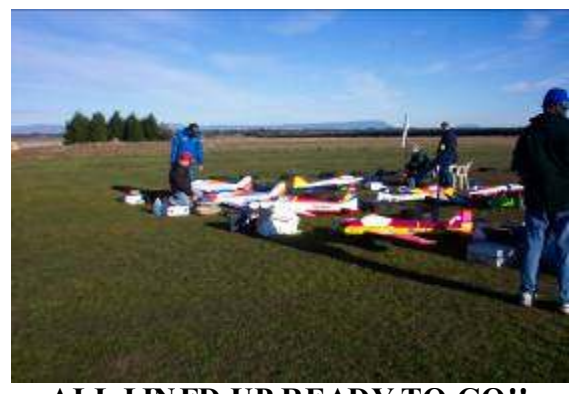
ALL LINED UP READY TO GO!!